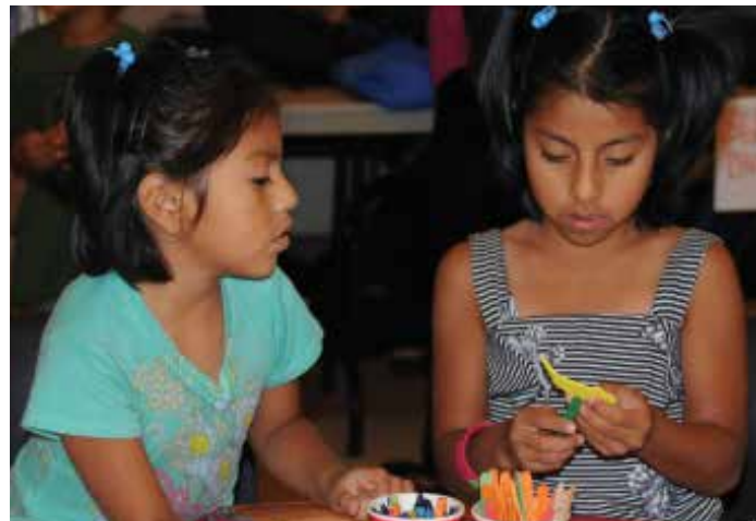
Children at PPH's annual Back-to-School Expo enjoy arts and crafts.