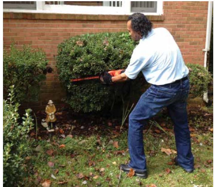
A volunteer from Snyder Cohn trims the bushes at one of our Hope Housing program sites.

One of the most important ways the community supports our work is by providing meals for the men at our HBCAC men's emergency shelter. FY13 was another banner year as 84,213 meals were donated—a 3% increase over last year.