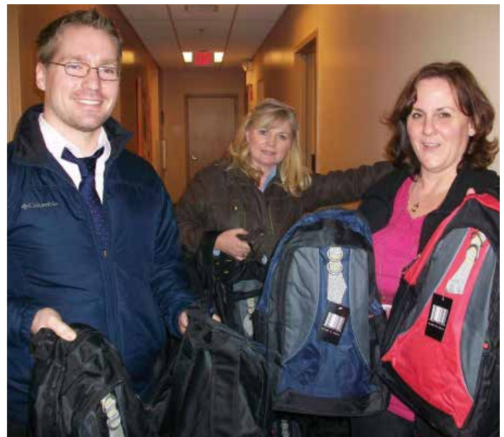
Employees from the Montgomery County Register of Wills donates new backpacks filled with necessities for HBCAC clients.