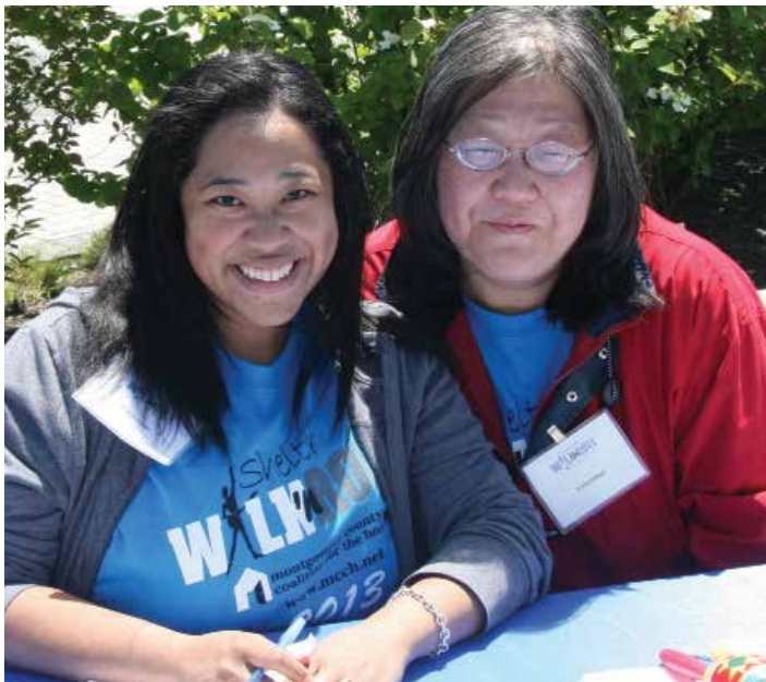
Volunteers at our events always help keep everything running smoothly.