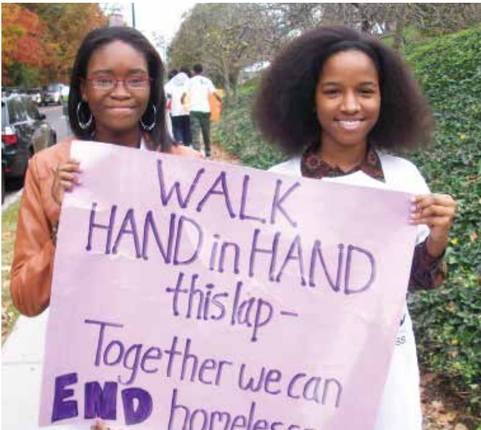
Duke Ellington School of the Arts in D.C. was one of the many local schools that held a Help the Homeless Walk to support our programs.